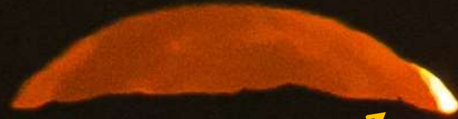
Nordic Optical Telescope La Palmalla